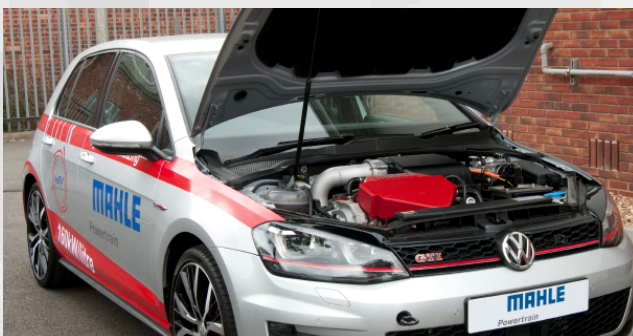
>> eSupercharged demonstrator vehicle