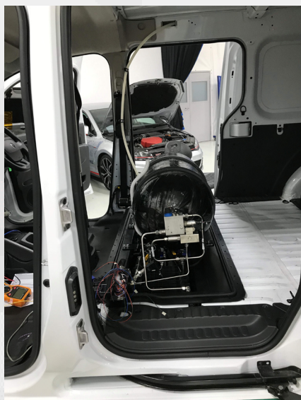
>> Bramble Energy FCEV demonstrator vehicle