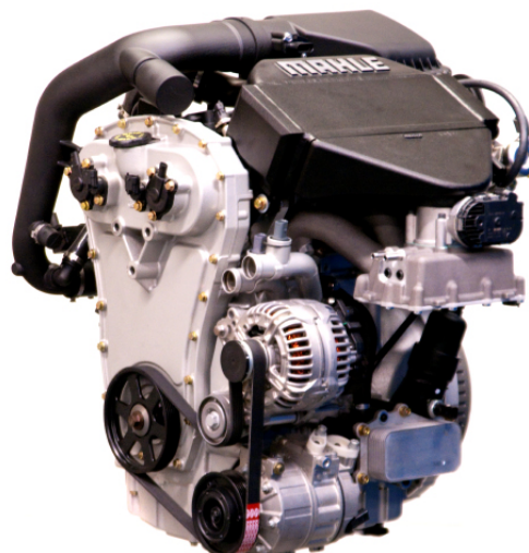
>> MAHLE downsizing engine