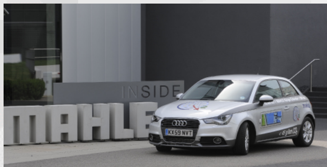
>> MAHLE range extender demonstrator

MAHLE ZG Transmissions Georg-Kollmannsberger-Str. 3 85386 Eching Germany Tel. +49 89 18 94 169-0