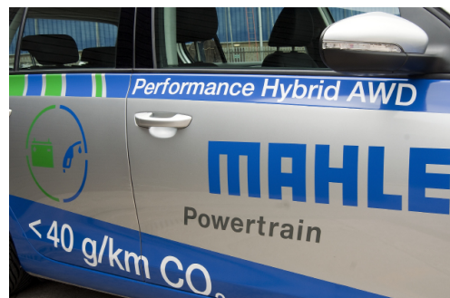
>> Parallel hybrid demonstrator vehicle

In addition to the packaging benefits, the in-wheel motors also bring advantages in the areas of performance and handling. In-wheel motors offer a large flat-torque response and the delivery of tractive effort is instant and seamless. This in turn sharpens up the feel of the vehicle by improving the response to driver torque demand.