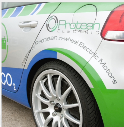
>> Protean in-wheel electric motors

The in-wheel motors, which also incorporate the disc brake and associated power electronics, provide an innovative solution to this challenge by utilising the available space within, and around, the wheels.