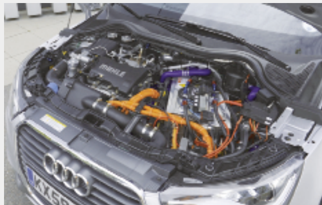
>> Range extender engine in demonstrator vehicle