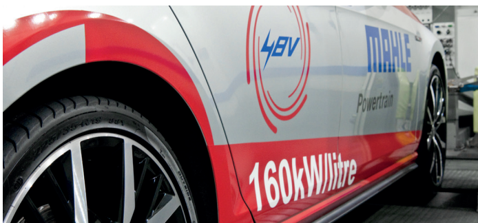
Very high engine outputs are achievable with a 48V system on board

Many hybridization advantages could be delivered by 48V systems without the complexity of a much higher voltage architecture. Such systems can maximize the use of regenerated electrical energy, provide more power to support higher electrical system demands, further enhance vehicle performance and contribute significantly toward achieving lower CO 2 emissions levels. ©