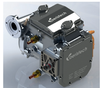
Aeristech's 48V eSupercharger is a powerful enabler for torque assist

Considerable performance benefits can also be achieved when a 48V system is employed as an 'enabler' in mild hybrid (that is, non-plug-in) applications. The established trend toward engine downsizing has highlighted the need for enhancing low-speed torque to preserve good launch performance and transient acceleration capability. In a vehicle without electric traction motors, this torque-assist functionality can be delivered either by means of advanced motor-generators (which